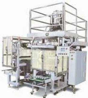
Injectable Liquid Filling Machines