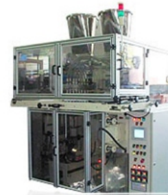
Multy Track Liquid Filling Machines