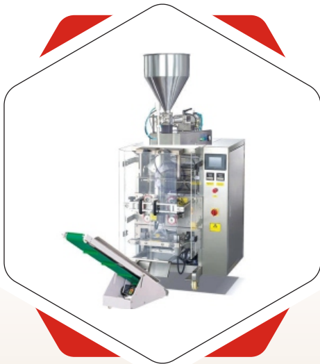
Aerosol Liquid Filling Systems