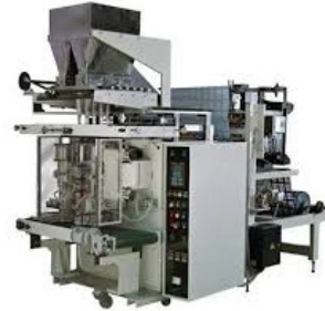
6 Track Powder Filling Machine