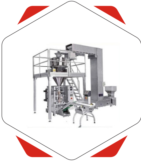
Multi Head Weigher