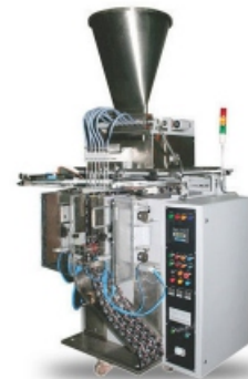
Automatic Liquid Filling Machines